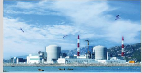
TIANWAN & QINSHAN NUCLEAR POWER STATIONS CHINA

Visit us online at zenitel.com for more information about our references and Vingtor-Stentofon Industry projects.