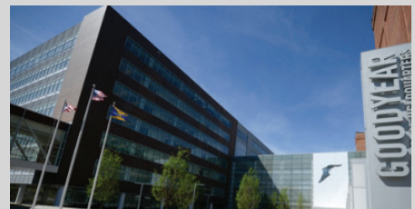
GOODYEAR TIRE & RUBBER PLANT TOPEKA, KANSAS, USA